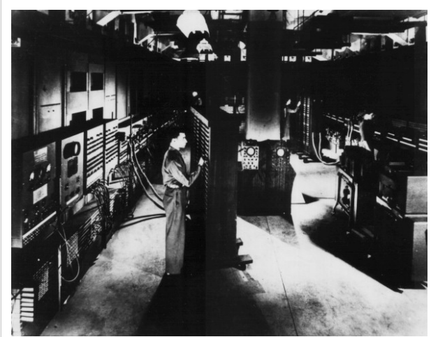
The ENIAC, at the Moore School of Electrical Engineering.

In the 1940s and 50s, a handful of scientists from a variety of fields (mathematics, psychology, engineering, economics and political science) began to discuss the possibility of creating an artificial brain. The field of artificial intelligence research was founded as an academic discipline in 1956.