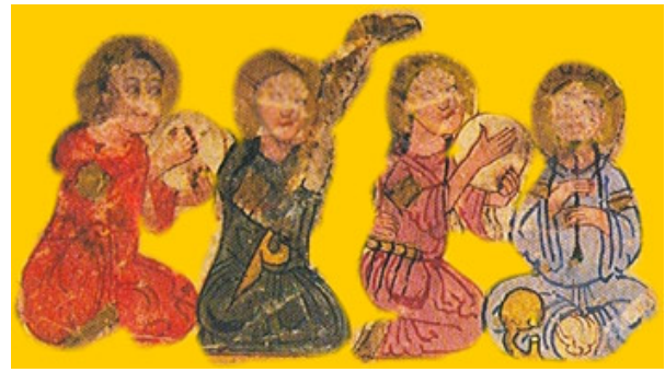
Al-Jazari's programmable automata (1206 CE)

Realistic humanoid automatons were built by craftsman from every civilization, including Yan Shi, [9] Hero of Alexandria, [10] Al-Jazari [11] and Wolfgang von Kempelen. [12] The oldest known automatons were the sacred statues of ancient Egypt and Greece. The faithful believed that craftsman had imbued these figures with very real minds, capable of wisdom and emotion—Hermes Trismegistus wrote that "by discovering the true nature of the gods, man has been able to reproduce it." [13] [14]