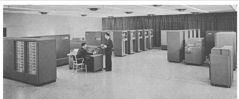
The IBM 702: a computer used by the first generation of AI researchers.