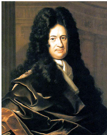
Gottfried Leibniz, who speculated that human reason could be reduced to mechanical calculation

Majorcan philosopher Ramon Llull (1232–1315) developed several logical machines devoted to the production of knowledge by logical means. [16] Llull described his machines as mechanical entities that could combine basic and undeniable truths by simple logical operations, produced by the machine by mechanical meanings, in such ways as to produce all the possible knowledge. [17] Llull's work had a great influence on Gottfried Leibniz, who redeveloped his ideas. [18]