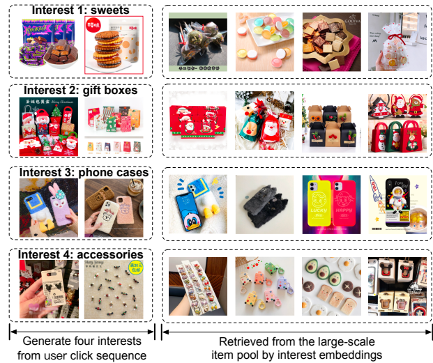
Figure 3: A case study of an e-commerce user. We generate four interest embeddings from the click sequence of a random user by our model. We find that the four interests of the user are about sweets, gift boxes, phone cases, and accessories. We report those items in the click sequence that correspond to the four interests. The right part shows the items retrieved from the industrial item pool by four interest embeddings.

We conduct an offline experiment between our framework and the state-of-the-art sequential recommendation method, MIND [31], which has shown significant improvement in the recommender system of Alibaba Group. The experimental result demonstrates that our ComiRec-SA and ComiRec-DR improve recall@50 by 1.39% and 8.65% compared with MIND, respectively.